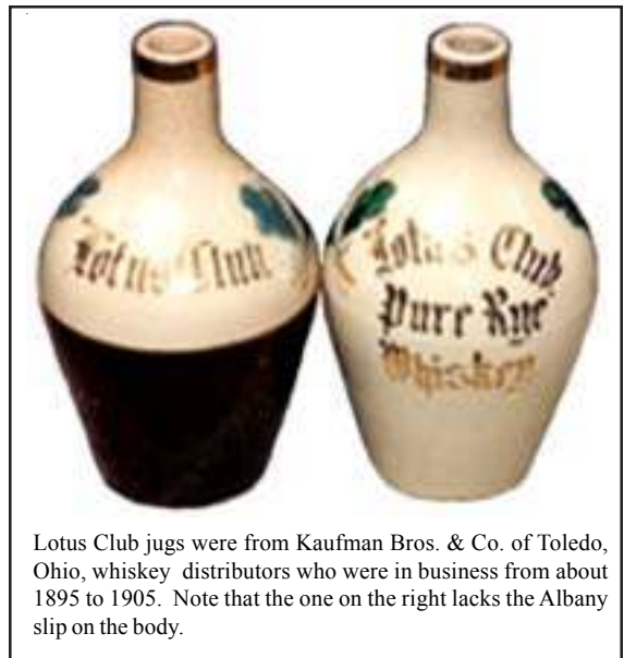
Lotus Club jugs were from Kaufman Bros. & Co. of Toledo, Ohio, whiskey distributors who were in business from about 1895 to 1905. Note that the one on the right lacks the Albany slip on the body.

He noted that until he saw my photos of these jugs, he had wondered what items were being decorated in the low-fire kiln since none had ever come to his attention. He knows of no catalogs or other paper records for this line of ceramics, except