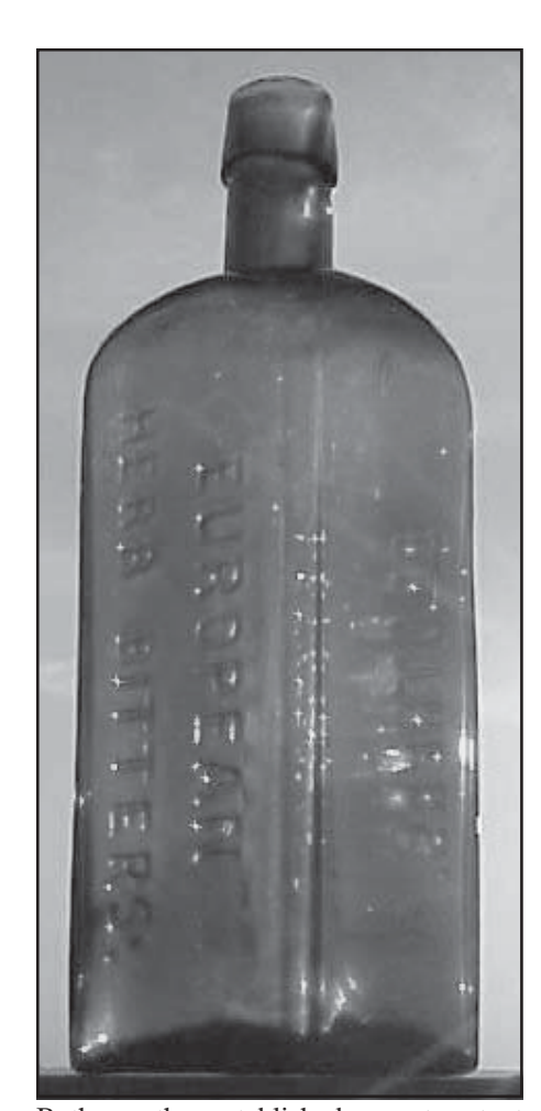
Both men then established separate patent medicine companies, both of which were very successful.

All known examples have been blown from the same mold and are embossed BEGGS DANDELION BITTERS on one side and SIOUX CITY IOWA on the opposite side. The bottles will display various degrees of crudeness and come in a wide range of amber coloration. The examples shown here display the drastic difference in color. One bottle is a wonderful light yellow amber while the other bottle is a very dense amber with hundreds of seed bubbles in the glass to add to its character.