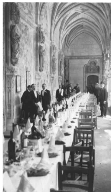
Figure 4. Banquet at the 1900 International Viticultural Congress.

Of further note, Wiley identified a total of 66 U.S. exhibitors at the 1900 Paris Exposition in his report; 40 of which were medal winners. For that event the winning exhibitors receiving awards were: California wines totaled 26 medal winners (5 Gold, 9 Silver, 8 Bronze and 4 Honorable Mentions); New York had 6 medal winners (1 Gold, 1 Silver, and 4 Bronze); Florida had 1 Gold winner; North Carolina had 1 Silver winner; Virginia had 1 Bronze winner (Monticello Wine Company, Charlottesville, Va.); Ohio had 2 Silver winners; and, Washington, D.C. had 1 Bronze winner (Ch. Xander, Washington, D.C.). 39