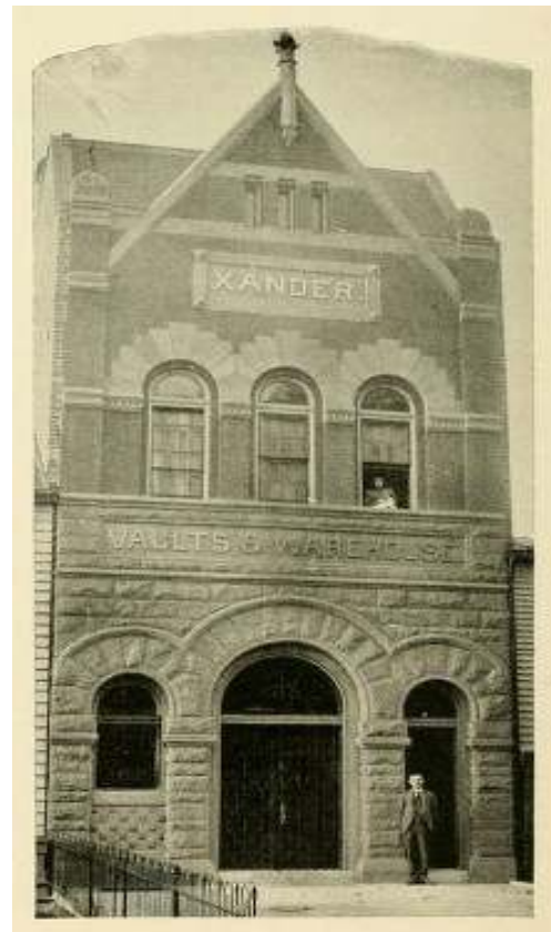
Figure 2. Xander's Vaults and Warehouse where the wine was made on Massachusetts Avenue.