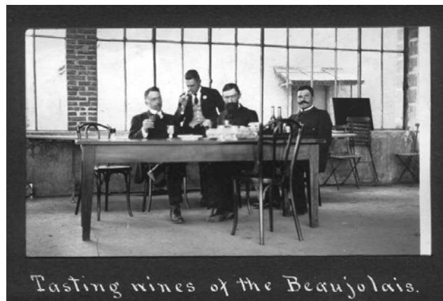
Figure 3. "Tasting wines of the Beaujolais" - 1900 Paris Exposition.

Agriculture and is the author and who was the individual that conducted the chemical analyses of the American participant's wine submissions judged at the 1900 Paris Exposition. 38