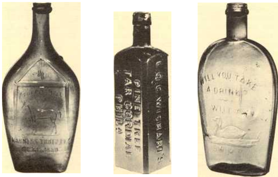
Flora Temple Flask and Wishart's Pine Tree Cordial bitters bottle made in Lancaster; Lockport flask.

The Lancaster bottle showing the famous harness trotting horse, "Flora Temple," has been found in several colors and in quart and pint sizes with or without a handle. Her world record of 2.19-3/4 (a mile in two minutes, nineteen and three-fourths seconds) and the date it was set, October 15, 1859, appear on the bottle, although the entire date is omitted in some cases.