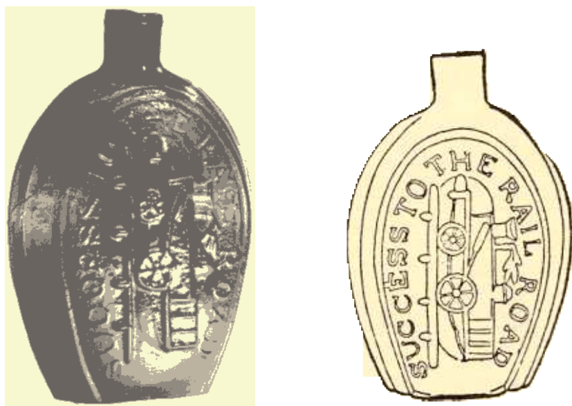
Lancaster Railroad Flask.

Early in the 1830's the steam locomotive was beginning to replace horsepower and was the subject of twelve known varieties of flasks. The Lancaster pint flask has on both sides a steam locomotive with the words "Success to the Railroad." Although the railroad flasks are not marked to indicate that they were made in Lancaster, they do occur in the same range of colors as flasks that are marked with the Lancaster identification. For example, Lancaster's "Cornucopia and Urn" flask made between 1850 and 1860, marked "Lancaster Glass Works, N.Y.," is found in the same distinctive blue as their railroad flask. The colors listed for the Lancaster railroad flask include its typical olive-greens and ambers and show the nuances of color categories used by the collectors: olive-yellow, light sapphire blue, golden amber, deep amber, clear green, clear olive-green, aquamarine, clear with pale yellow tint, olive-amber, cloudy yellowish or mustard green almost opaque, all of which are comparatively scarce, and a clear dark olive-green which is rare.