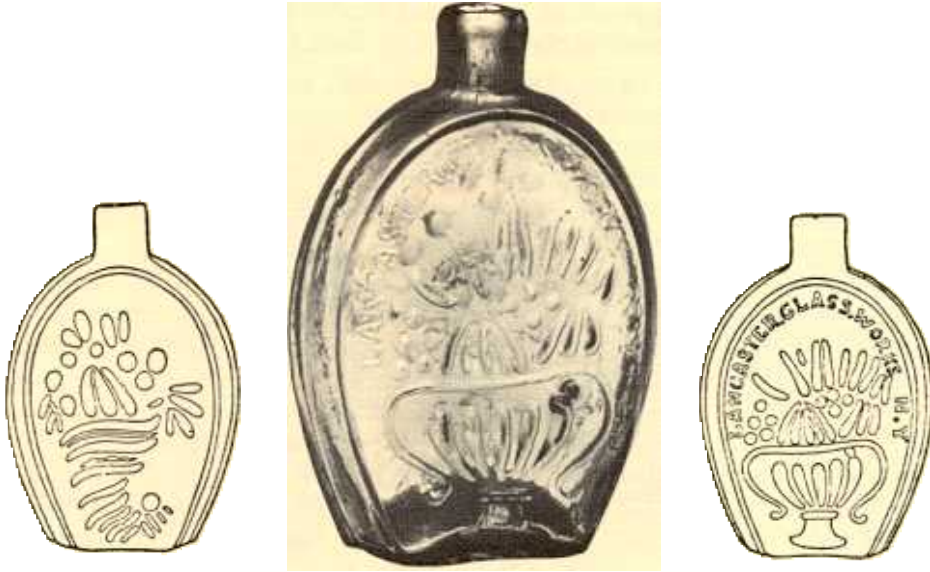
Lancaster Cornucopia and Urn Flask, 1850-1860; sketches of front and back.

The "Pike's Peak" flask made at Lancaster and other factories represents another dramatic event in our economic history, a gold rush in Colorado in 1859 at a time when our country was in one of its periodic financial depressions. Hordes of unemployed workmen, bankrupt businessmen, and adventurers had nothing to lose and hurried West. Because the gold find was in the area of the mountain called Pike's Peak many easterners traveled to that point, crying "Pike's Peak or Bust." The flask shows the figure of a prospector carrying a staff in his left hand and a pack over his right shoulder. Above his head are the words, "For Pike's Peak." It is believed that Lancaster's design showed the traveller, but not the inscription. The Pike's Peak flask is usually categorized under the American eagle flasks, as the eagle appears on the reverse. The eagle, symbolizing strength and sovereignty, has been widely used as a decorative motif and emblem of state since ancient times. The Great Seal of the United States adopted in 1782 shows the American bald eagle with a shield on his breast, an olive branch symbolizing peace in his right talon, and a bundle of thirteen arrows symbolizing power in his left talon. This motif, used in all arts and crafts is found on more than 100 historical flasks although seldom identical to the eagle on the Great Seal. On many flasks he bears a closer resem-