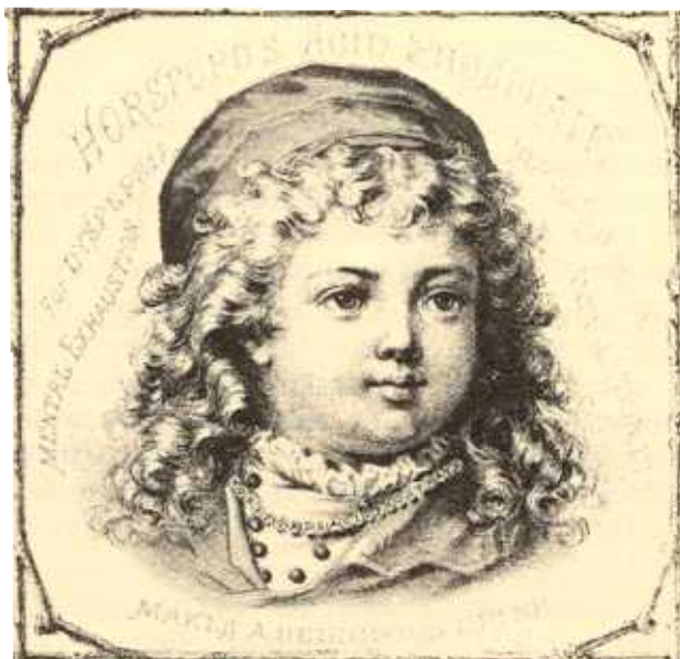
Trade card advertising Horsford's Acid Phosphate, manufactured by Rumford Chemical Works.

During the 1870's Lancaster was a large producer of brown bottles for some of these medicines. It should be noted that these brands were not exclusively Lancaster products. Manufacturers purchased their supply of bottles from the maker who quoted the best price. Examples of the Lancaster bottles were: Burdock Bitters; Clarissy's White Oil Liniment; Dr. Fish Bitters; Flora Temple; Hostetter's Bitters; G. W. Merchant, Lockport, N.Y. (also made in Lockport); Monitor Inks; Picnic; Plantation Bitters; John Roach Bitters; Shilo's Cough Cure; Shoo-Fly; Stimson and Hebblewhite Blacking; Summerville Horse Medium, Buffalo, N.Y. (shape of horse's hoof); Warner's Safe Bitters; Warner's Tippecanoe Bitters; Wishart's Pine Tree Cordial; C. B. Woodworth, Rochester, N.Y. (many shapes including boots and slippers); and a barrel shaped bottle.