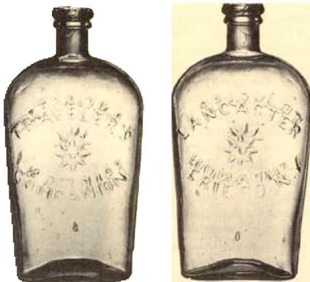
Lancaster Traveling Companion's Flask, front and back.

Lancaster also made the "Scroll" flask which was violin or heart-shaped with a purely decorative scroll design.