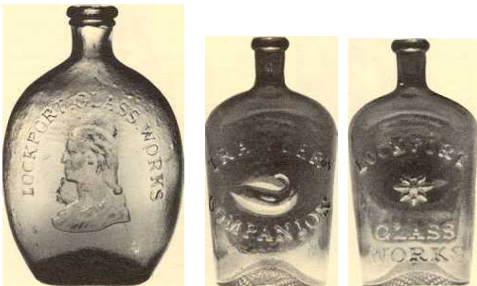
Lockport Washington Flask. Lockport Traveler's Companion Flask, front and back.