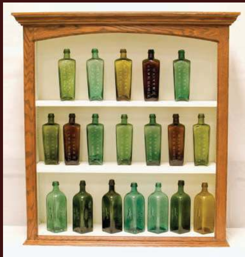
Displays of the recently dug London Jockey Club House and Wister's Club House bottles were a highlight of the show. Even the rare color glass shards captured the attention of many of the collectors that visited the show