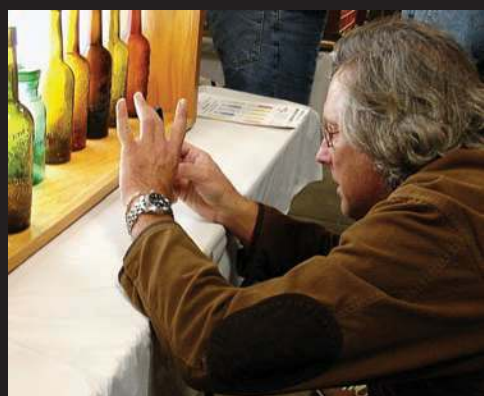
Ferdinand Meyer V capturing a photograph of some interesting glass sparkling like gemstones